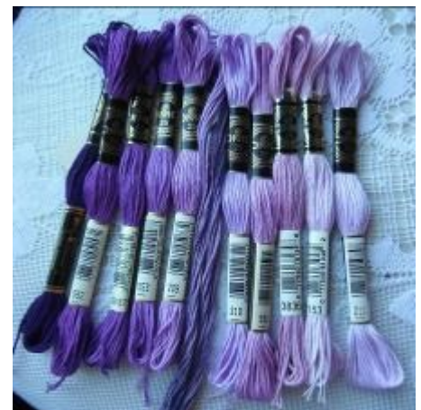
550 : 552 : 3837 : 553 : 209 : 210 : 554 : 3836 : 153 : 211

Simply Shaker Sampler Threads by The Gentle Art SAM 05 - Uniform Blue (or another alternative: Brethren Blue)