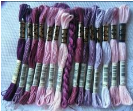
154 : 3740 : 315 : 3727 : 778 : 225 315 : 3740 : 3041 : 3042 : 3743 : 778 : 3713