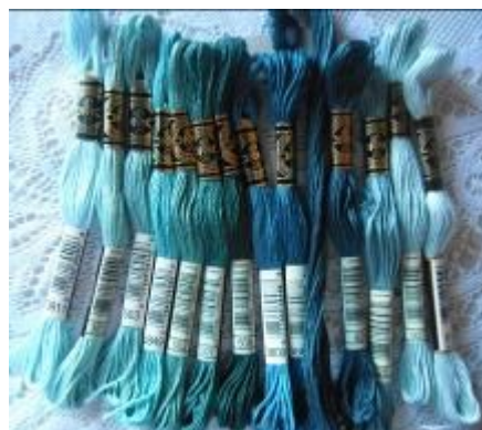
38141 : 3813 : 503 : 3849 : 502 : 501 : 3809 : 3808 924 : 926 : 927 : 928

Sampler Threads by The Gentle Art SAM 05 - Hyacinth