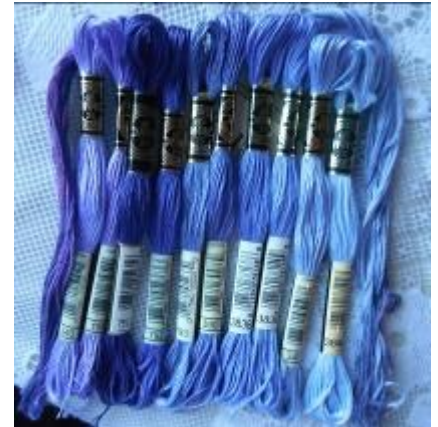
340 : 155 : 791 : 792 : 793 : 3807 : 3838 : 3839 : 341 : 3840