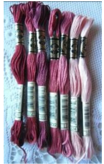
321 : 3721 : 315 : 3722 : 223 : 224 : 225