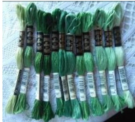
3348 : 3347 : 3346 : 3345 : 987 : 367 : 320 : 988 : 989 : 368 : 164 : 369

Silk 'n Colors by The Thread Gatherer SNC 171 - Cerise Noir