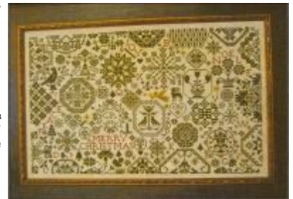
NASH : BG-QX - A Quaker Christmas

On the back cover of this design, Ellen has the following to say .... "The Quakers were among the first to realise the importance of education of both boys and girls. Students were taught skills that would be helpful later in life. Needlework was included in the curriculum for girls. They typically made four different kinds of samplers: marking, darning, extract (a sampler with a prose text enclosed by a