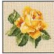
K:YR - Yellow Rose

Accessories: Keslyn's also has jewellery pieces in which small pieces of needlework (stitched over one thread of linen fabric or on silk gauze) may be inserted. The little floral designs above are excellent for these items.