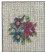
K:TRIO - Trio