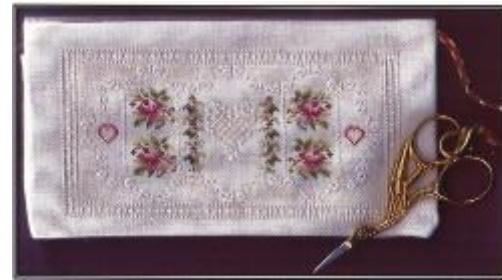
K:LYNDA Lynda's Travel Sewing Kit