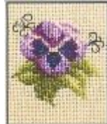
K:PS - Pansy Single