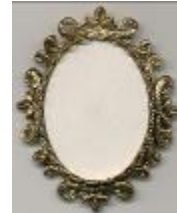
K:BLS - Brooch Loops & Swirls