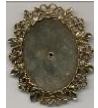
K:BFL - Brooch Flowers & Leaves

These jewellery items are lockets and two pieces of needlework can be inserted, as both the back and front of the lockets are clear. The locket frames are nickel plated.