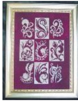
K:DELIGHTS ~ Delights