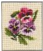
K:PT - Pansy Trio