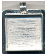
K:NS - Necklace Square (silver)