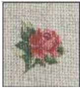
K:PPR - Peachy Pink Rose