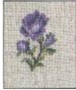
K:PR - Purple Rose