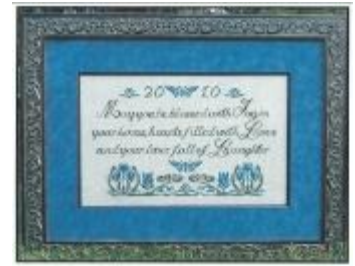
K:MAY May You Be Blessed