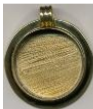
K:NR - Necklace Round (gold)