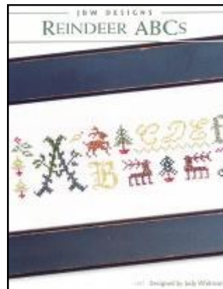
JBW 287 Reindeer ABC's