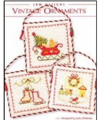
JBW 288 Vintage Ornaments