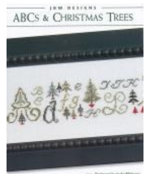
JBW 265 ABC's & Christmas Trees