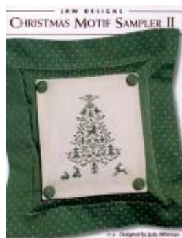
Christmas Motif Sampler II