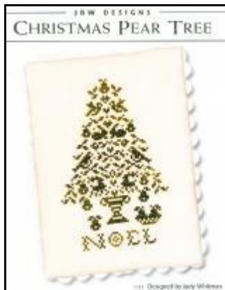
JBW 285 Christmas Pear Tree