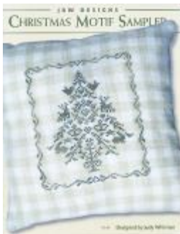
Christmas Motif Sampler