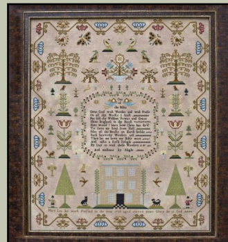
HATS : ML Mary Lea 1793 $ 57.50