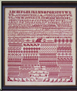
HATS : HS Harriett Salt 1866 $ 57.50