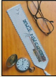
Red Billed Gull