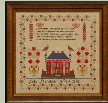
HATS : SS Sally Stansfield 1841 $ 57.50