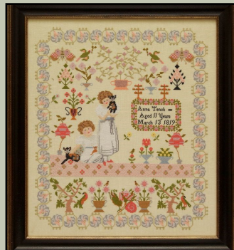
HATS : AT Anna Tench 1819 $ 57.50