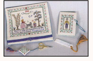
GPA : KATY Katy's Sewing Purse $40.00

GPA : DUTCH A Dutch Sewing Pillow $40.00