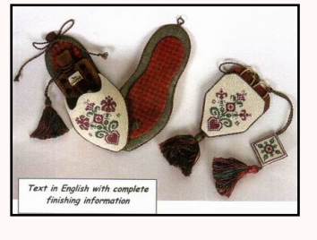
GPA : Xmas Christmas Sewing Set $ 40.00