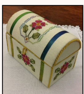
GPA : ETRUNK Elizabeth's Trunk $ 40.00