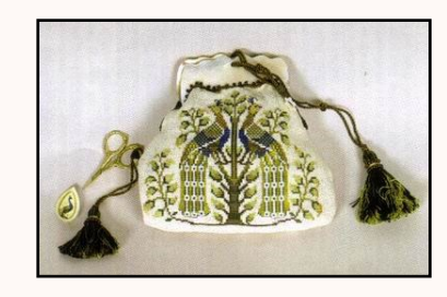
GPA : PURSE Italian Peacocks Purse $ 40.00

GPA : BPILLOW Blue Sewing Pillow $ 40.00