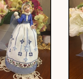
Images of my 'Winter' Pincushion Doll before she was lost in the flood ~