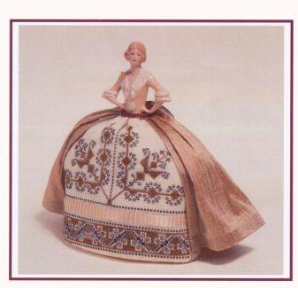
GPA : SOFIA Sofia - An Italian Pincushion Doll